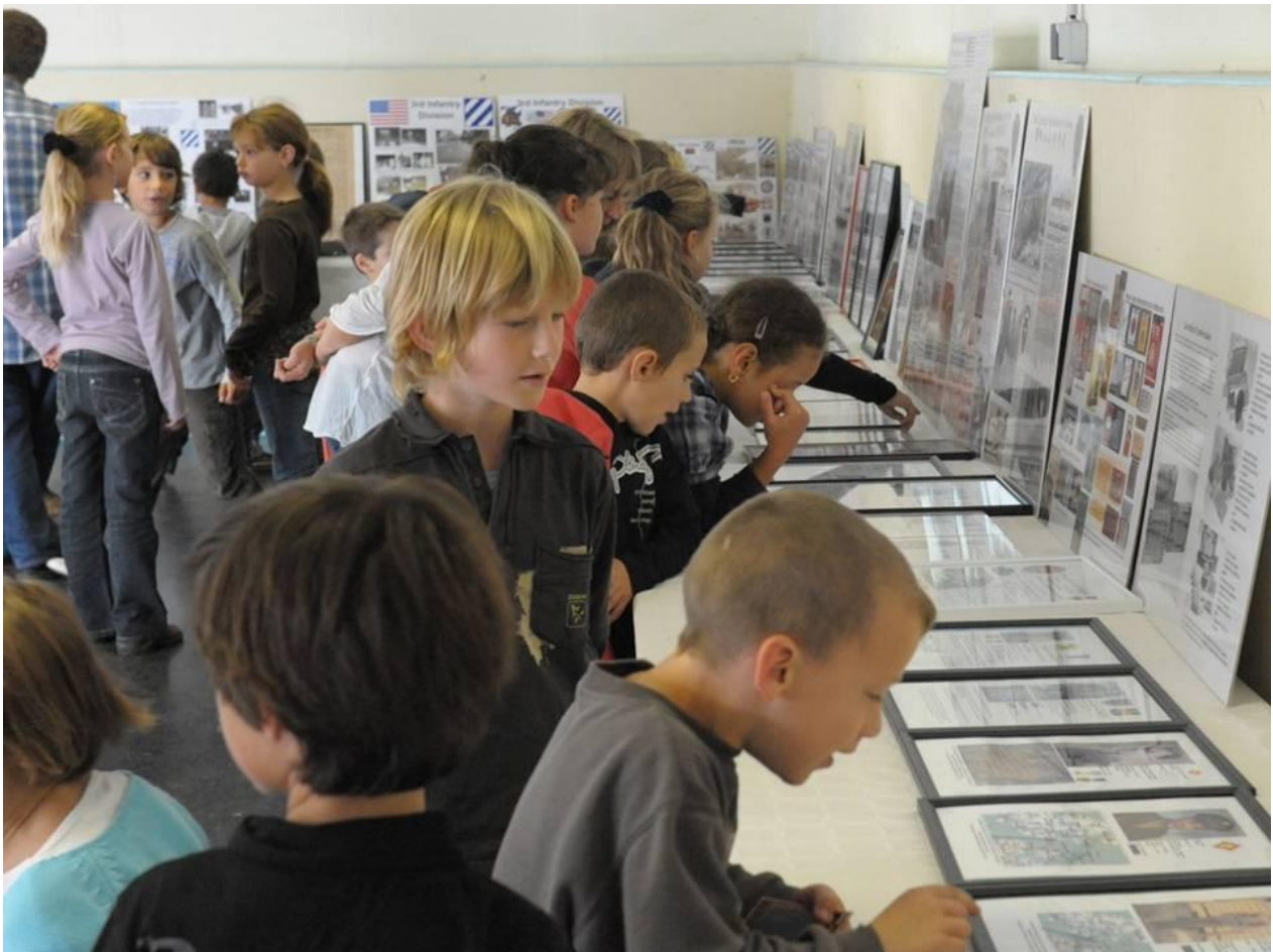
School of Echenoz la Meline, September 2009