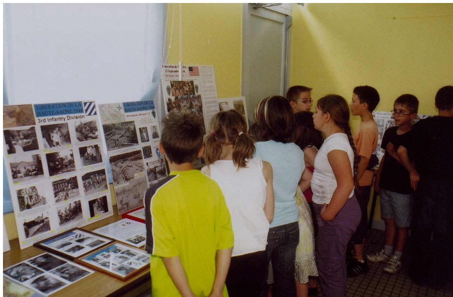
School of Roye, May 2008