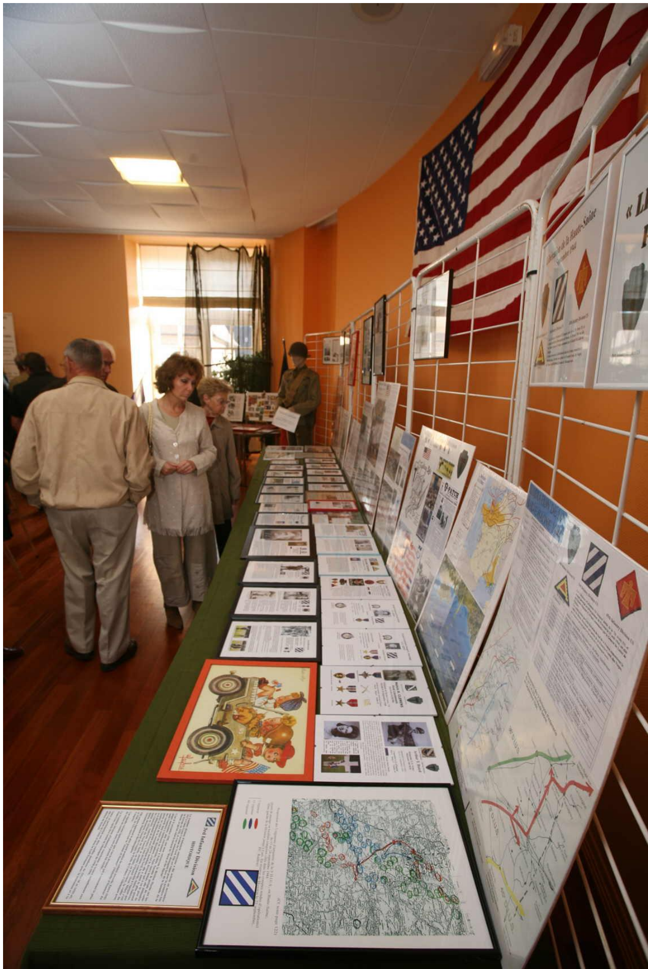
Luxeuil, Town Hall, September 2008