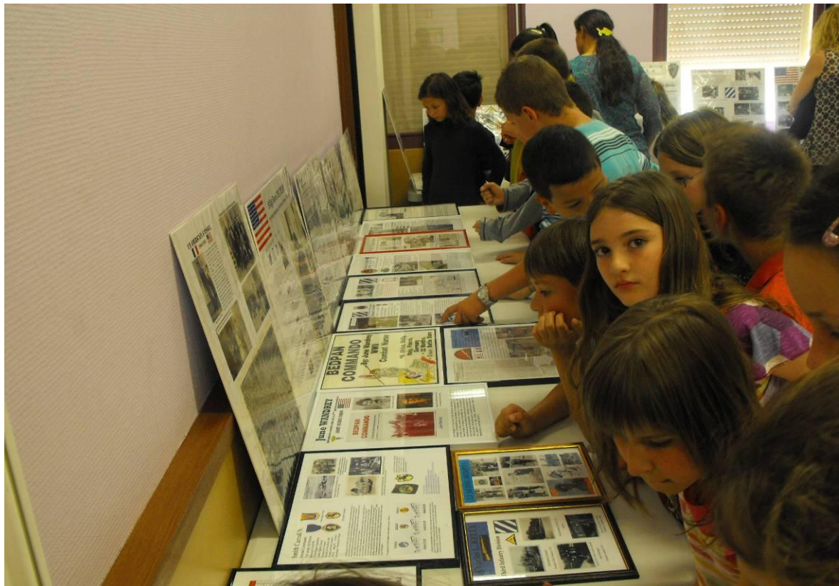
Saulx de Vesoul, May 2 nd , 2011