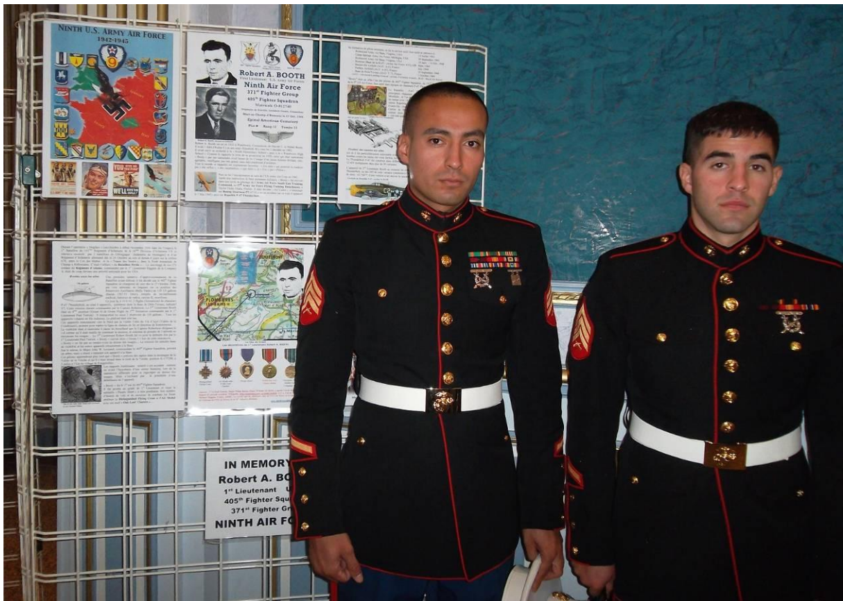
The few, the proud, the Marines !