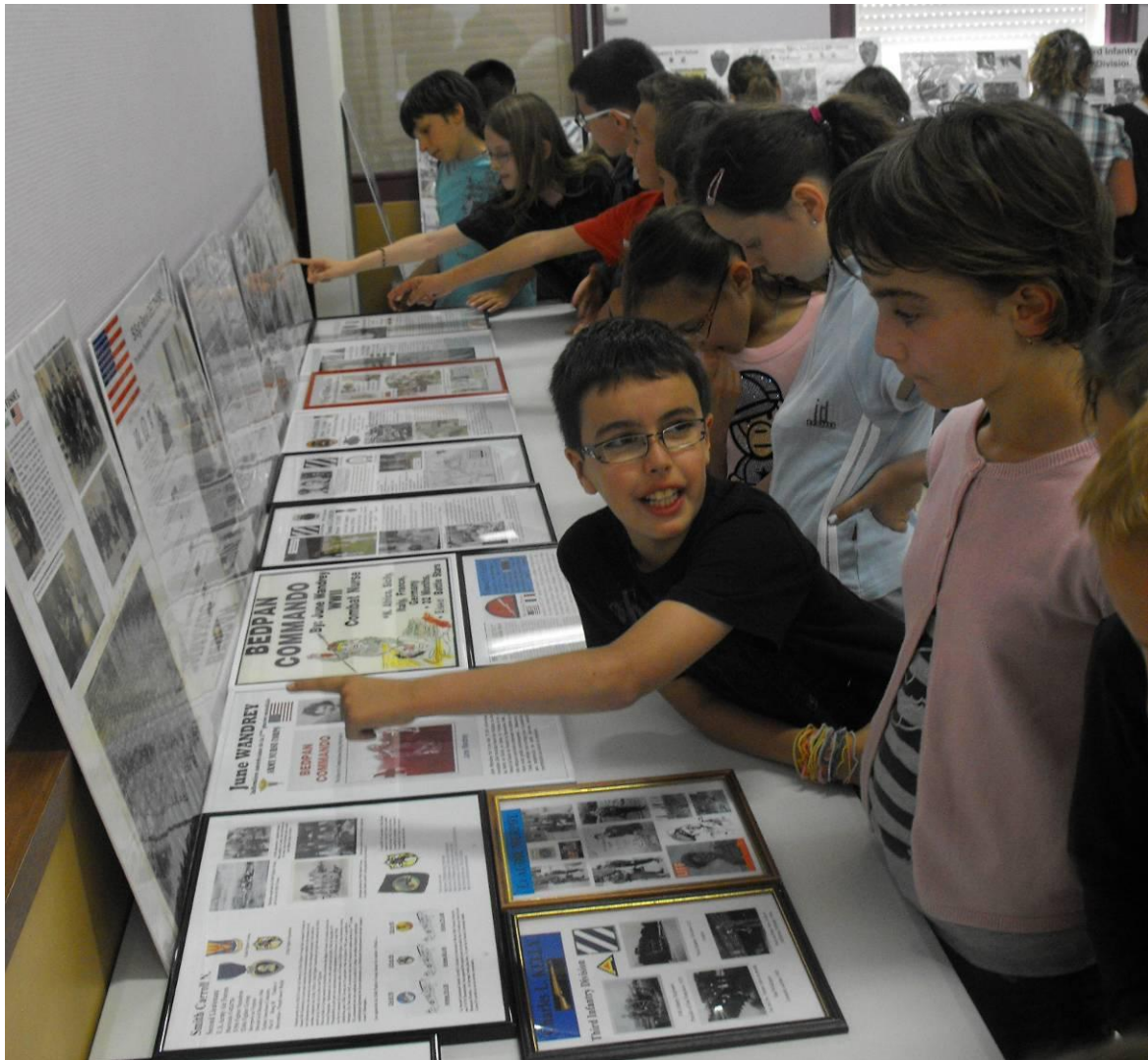
Saulx de Vesoul, May 2 nd , 2011