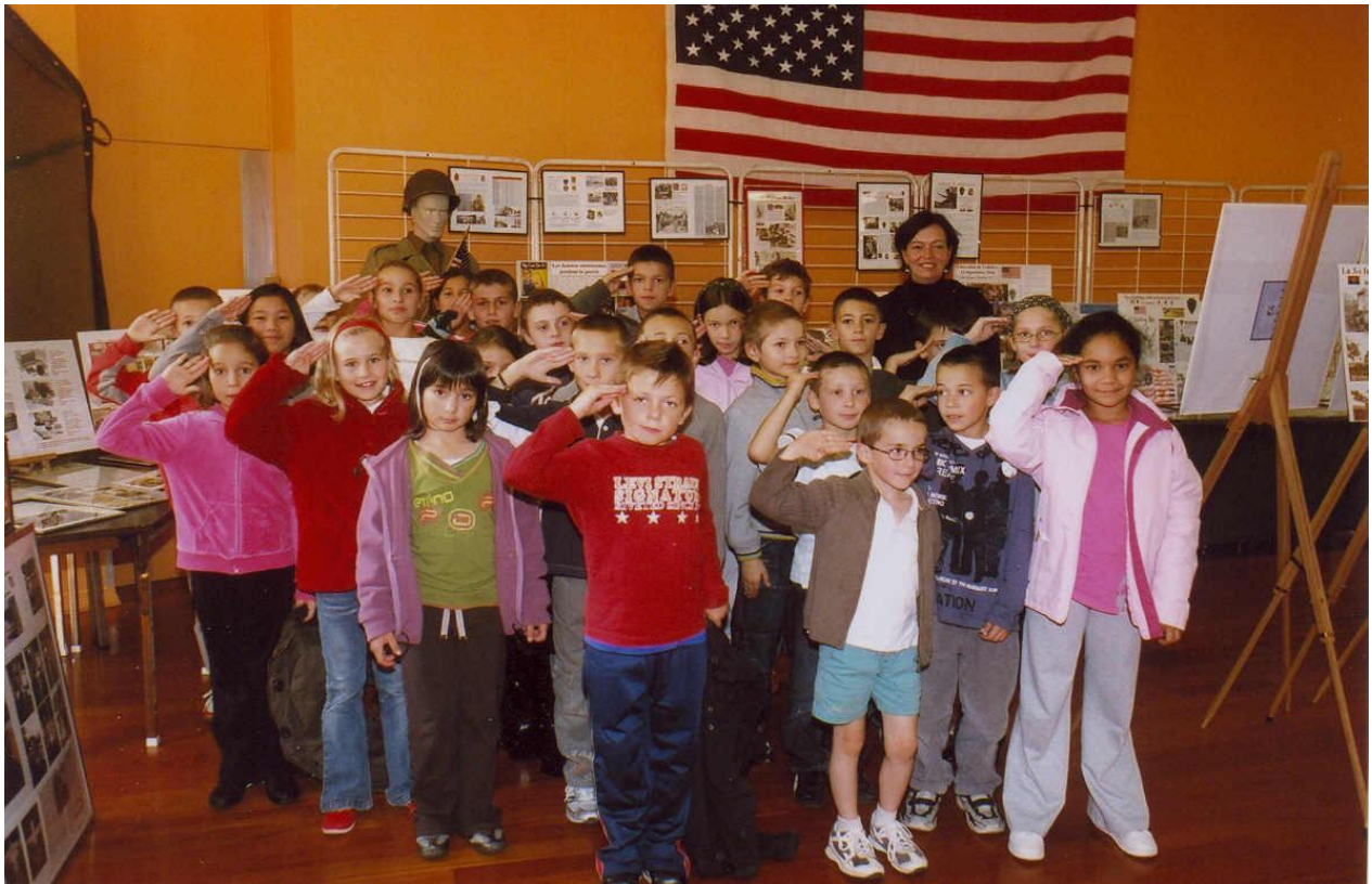
The Children of Luxeuil wanted to salute the American soldiers who saved France in 1944 and 1945...