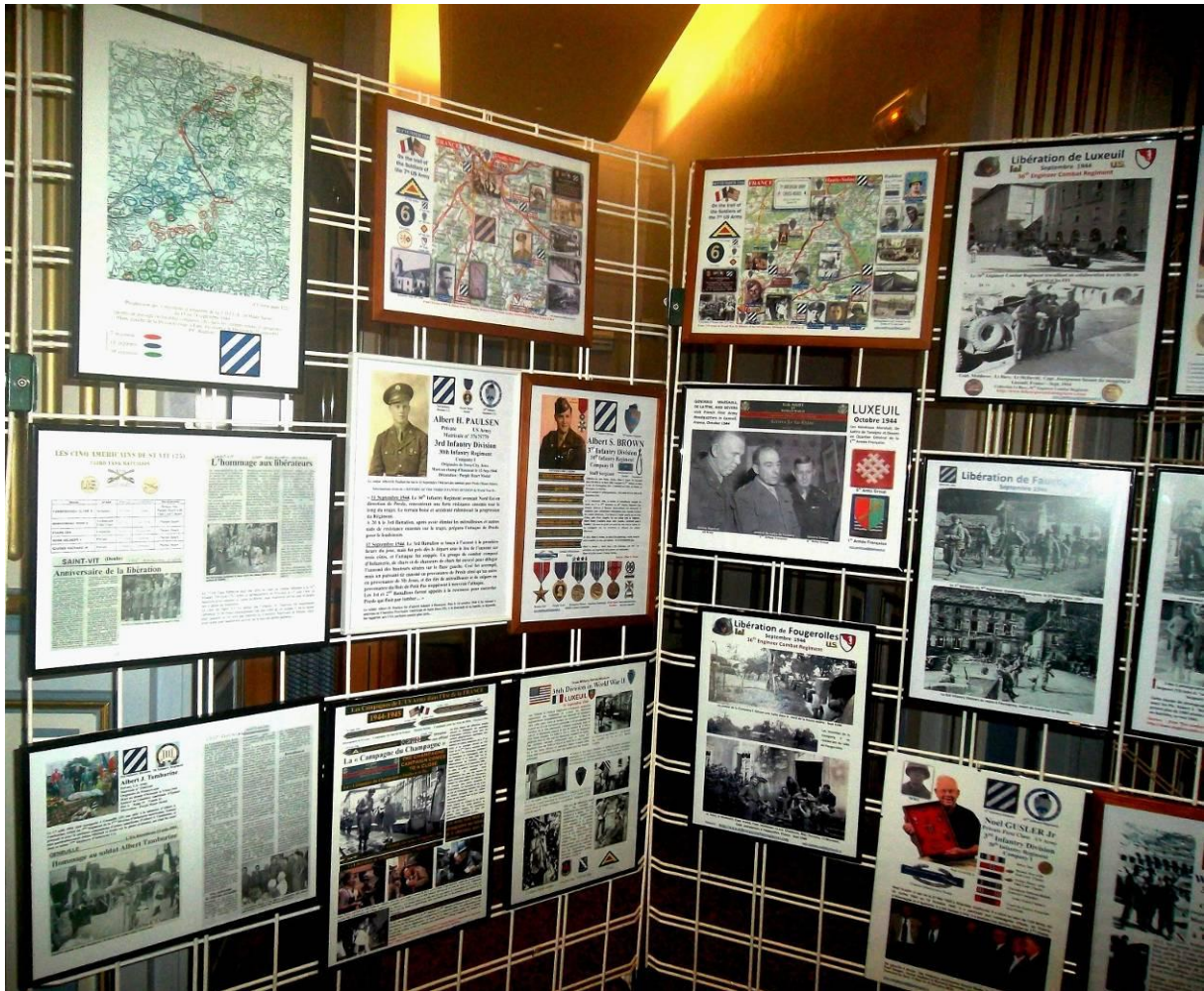
About the Liberation of Haute-Saône...