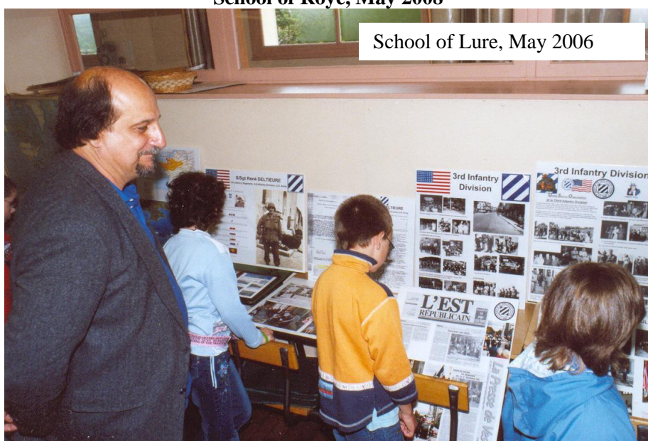
School of Lure, May 2006