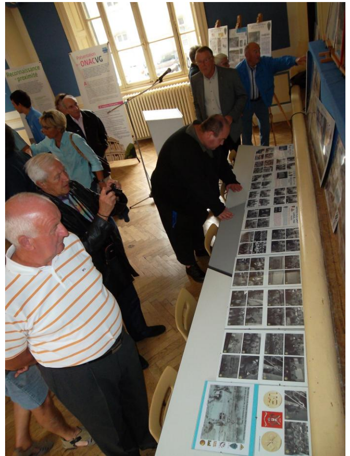
Vesoul, September 11 th and 12 th